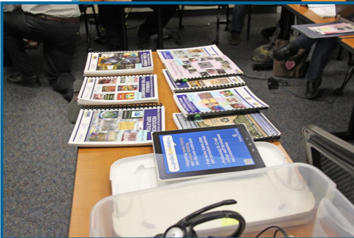
Below: Left: Project Look Sharp Kits Right: Attendees hard at work.